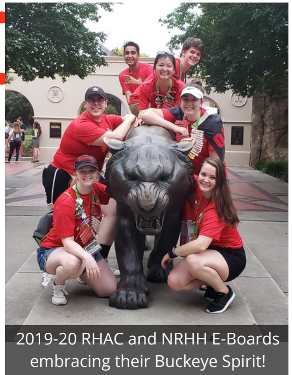
2019-20 RHAC and NRHH E-Boards embracing their Buckeye Spirit!