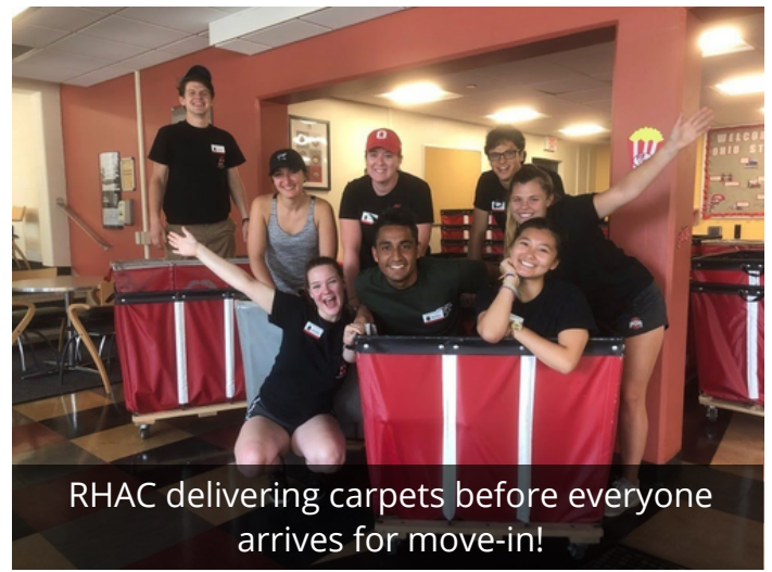
RHAC delivering carpets before everyone arrives for move-in!

This is a way that RHAC recognizes your residence halls for all of the hard work you do. Toward the end of the year, you will cultivate a presentation that will include a theme, hall council set up, hall council goals, activities and improvements, involvement in RHAC activities, leadership development, and recognition. The winner will receive a hall improvement grant and a plaque to display in their hall.